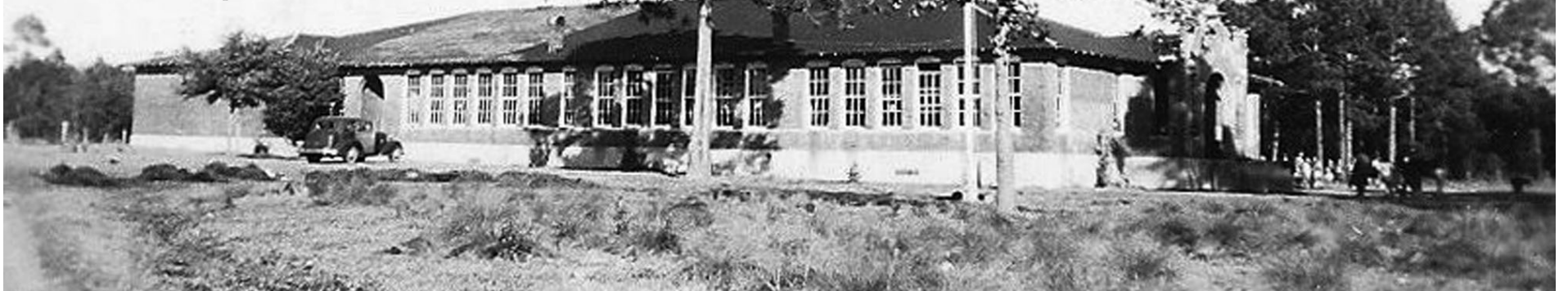
The old Holley Elementary School was once the hub of the community. The building was demolished years ago, and the only remaining images are in memories and old photographs such as this one.

3rd Annual Holley Community Reunion Holley Ball Park - 3146 Bob Tolbert Road Saturday, July 20, 11 a.m. - 2 p.m. Attendees are asked to bring chairs and a covered dish